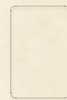
Space for Discarded Travel Cards